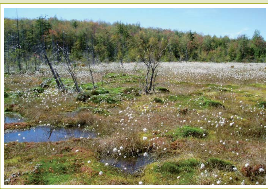
High Elevation Wetland—Otter Creek, Monongahela National Forest

public symposium to share information on the species and habitats listed in the plan, reassess the species in greatest need of conservation, set priorities for the next two years and revise the plan. In that way the Conservation Action Plan will remain a dynamic and useful document to conserve wildlife and their habitats for the future.