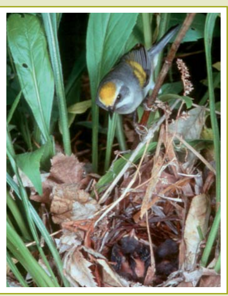
Golden-winged Warbler

Landscape: Approximately 12 percent of land in West Virginia is public land, with the remaining 88 percent in private holdings. Thus, West Virginia faces the challenge of working with private landowners to conserve species in greatest need of conservation.